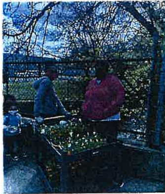
Clean Up Day